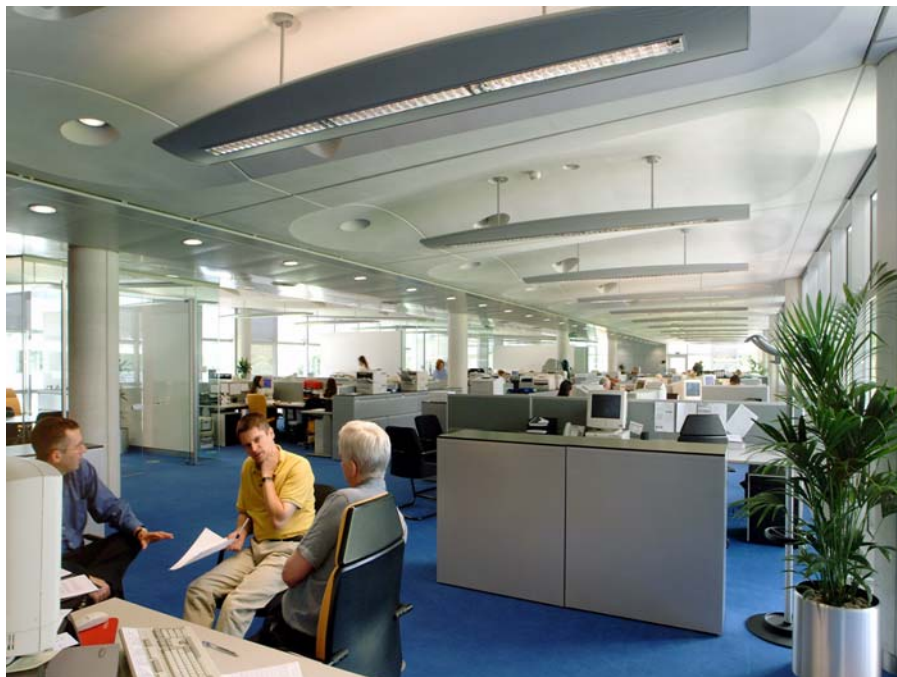
Concrete floor systems can span large distances with shallow floor systems helping improve daylighting and views (Indoor Environmental Quality Credit 8.1 and 8.2)

The intent of these credits are to provide for the building occupants a connection between indoor spaces and the outdoors through the introduction of daylight and views into the regularly occupied areas of the building. The strategy is to design the building to maximize interior daylighting and views to the outdoors through building orientation, shallow floor plates, and increased building perimeter. Concrete floor systems can span large distances with shallow floor plates and column free spaces to help achieve these credits. You can also use exposed concrete ceilings to reflect light deep into interior spaces. This credit is worth 1 point if 75% of the space has daylight (Credit 8.1) and 1 additional point if 90% of the space has views to the outdoors.