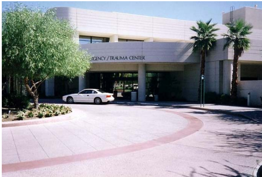
Concrete pavement can be used to reduce urban heat islands (Sustainable Sites Credit 7.1)

Another strategy to achieve this credit is to place a minimum of 50% of parking spaces under cover including underground, under deck, under roof, or under building. Concrete is typically the material of choice for parking structures. This credit is worth 1 point.