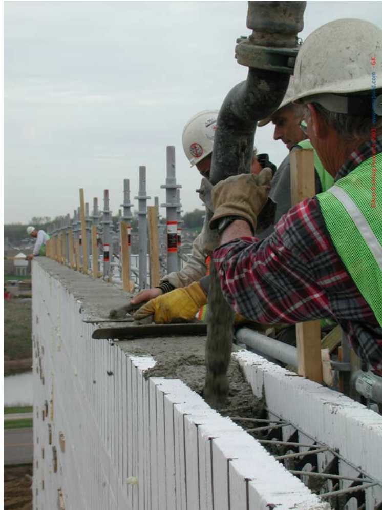
High performance concrete building systems such as insulating concrete forms, tilt-up concrete and concrete frame construction help a building meet the requirements of LEED 2009 NC energy performance requirements.

Insulated concrete systems, used in conjunction with other energy savings measures, will most likely be eligible for points under this credit. The number of points awarded will depend on the building, climate, fuel costs, and minimum requirements of the standard. From 1 to 19 points are awarded for energy cost savings of 12% to 48% for new buildings and 8% to 44% for existing buildings.